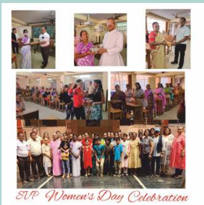
SVP Women's Day Celebration